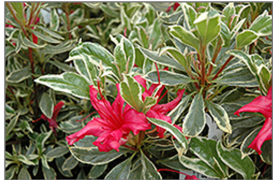
Girard's Variegated Gem Azalea flowers