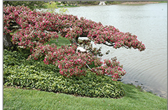
Candied Apple Flowering Crab in bloom