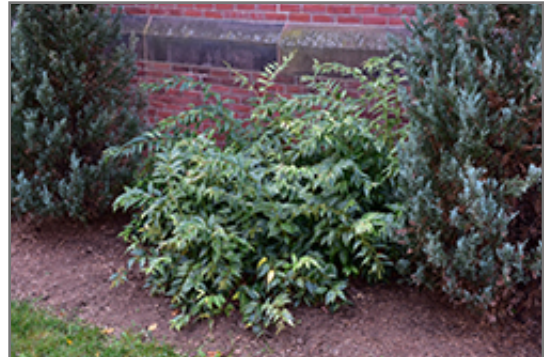
Rainbow Fetterbush