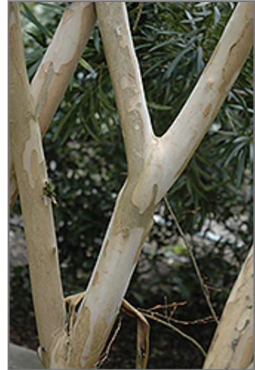
Zuni Crapemyrtle bark

Zuni Crapemyrtle makes a fine choice for the outdoor landscape, but it is also well-suited for use in outdoor pots and containers. Because of its height, it is often used as a 'thriller' in the 'spiller-thriller-filler' container combination; plant it near the center of the pot, surrounded by smaller plants and those that spill over the edges. It is even sizeable enough that it can be grown alone in a suitable container. Note that when grown in a container, it may not perform exactly as indicated on the tag - this is to be expected. Also note that when growing plants in outdoor containers and baskets, they may require more frequent waterings than they would in the yard or garden.