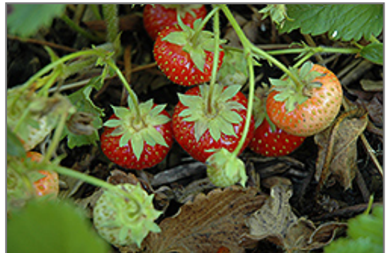
Common Wild Strawberry

Common Wild Strawberry features dainty white cup-shaped flowers with yellow eyes along the stems from late spring to early summer. Its attractive tomentose round compound leaves remain green in color throughout the season. It features an abundance of magnificent cherry red berries from late spring to late summer.