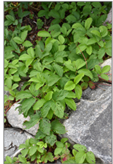
Common Wild Strawberry

Common Wild Strawberry is a good choice for the edible garden, but it is also well-suited for use in outdoor pots and containers. Because of its spreading habit of growth, it is ideally suited for use as a 'spiller' in the 'spiller-thriller-filler' container combination; plant it near the edges where it can spill gracefully over the pot. Note that when growing plants in outdoor containers and baskets, they may require more frequent waterings than they would in the yard or garden.