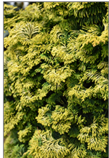
Dwarf Golden Hinoki Falsecypress foliage