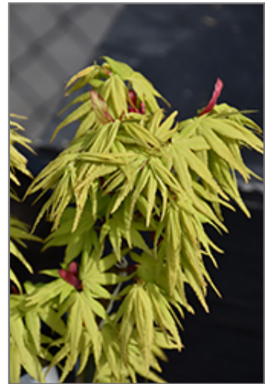
Mikawa Yatsubusa Japanese Maple foliage

Mikawa Yatsubusa Japanese Maple is recommended for the following landscape applications;