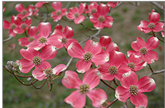
Cherokee Chief Flowering Dogwood flowers