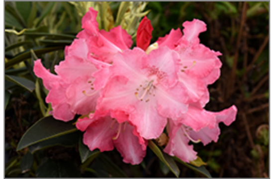
Solidarity Rhododendron flowers

Solidarity Rhododendron will grow to be about 5 feet tall at maturity, with a spread of 5 feet. It tends to be a little leggy, with a typical clearance of 1 foot from the ground, and is suitable for planting under power lines. It grows at a slow rate, and under ideal conditions can be expected to live for 40 years or more.