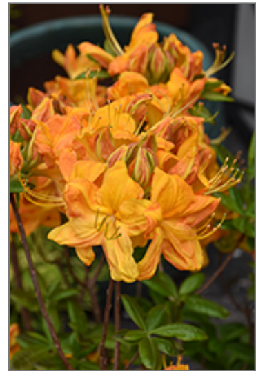
Klondyke Azalea flowers