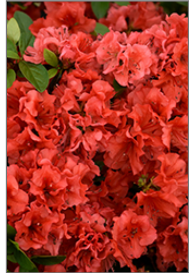
Girard's Hot Shot Azalea flowers