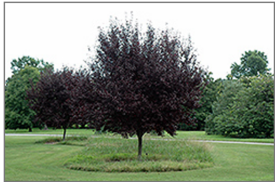
Krauter Vesuvius Plum

This tree should only be grown in full sunlight. It does best in average to evenly moist conditions, but will not tolerate standing water. It is not particular as to soil type or pH. It is highly tolerant of urban pollution and will even thrive in inner city environments. This is a selected variety of a species not originally from North America.