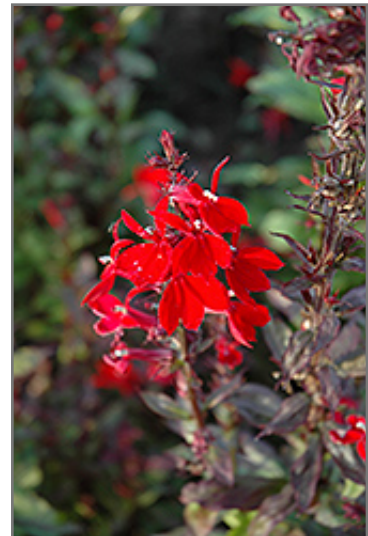
Queen Victoria Lobelia flowers