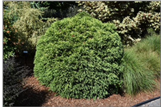
Dwarf Globe Japanese Cedar