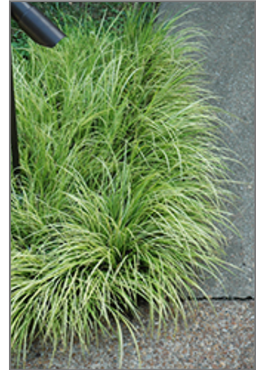
Grassy-Leaved Sweet Flag

Grassy-Leaved Sweet Flag will grow to be about 12 inches tall at maturity, with a spread of 12 inches. Its foliage tends to remain dense right to the ground, not requiring facer plants in front. It grows at a medium rate, and under ideal conditions can be expected to live for approximately 10 years. As an herbaceous perennial, this plant will usually die back to the crown each winter, and will regrow from the base each spring. Be careful not to disturb the crown in late winter when it may not be readily seen!