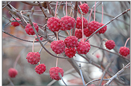
Milky Way Chinese Dogwood fruit

This tree does best in full sun to partial shade. It does best in average to evenly moist conditions, but will not tolerate standing water. It is very fussy about its soil conditions and must have rich, acidic soils to ensure success, and is subject to chlorosis (yellowing) of the foliage in alkaline soils. It is somewhat tolerant of urban pollution, and will benefit from being planted in a relatively sheltered location. Consider applying a thick mulch around the root zone in winter to protect it in exposed locations or colder microclimates. This is a selected variety of a species not originally from North America.