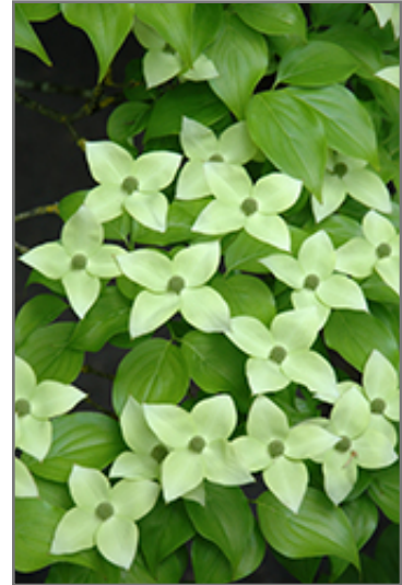
Milky Way Chinese Dogwood flowers

This is a relatively low maintenance tree, and should only be pruned after flowering to avoid removing any of the current season's flowers. It is a good choice for attracting birds to your yard. It has no significant negative characteristics.