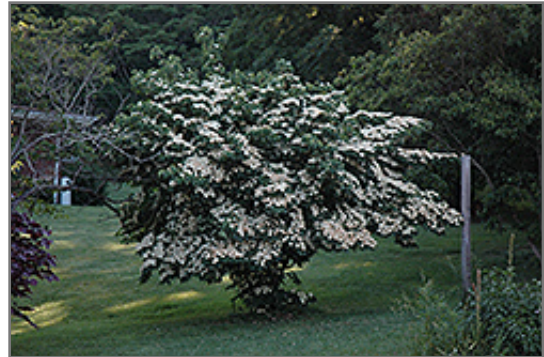
Milky Way Chinese Dogwood in bloom