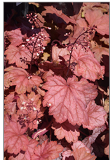
Georgia Peach Coral Bells in bloom