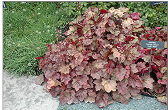
Georgia Peach Coral Bells

Georgia Peach Coral Bells is recommended for the following landscape applications;