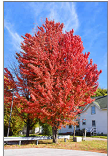
Celebration Maple in fall