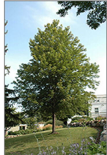
Celebration Maple