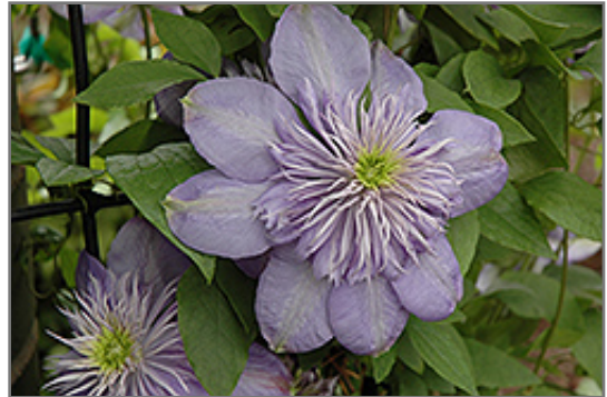
Blue Light Clematis flowers