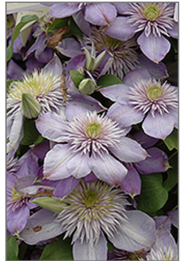
Blue Light Clematis flowers

Blue Light Clematis is recommended for the following landscape applications;