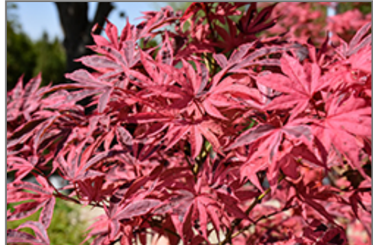
Shirazz Japanese Maple foliage