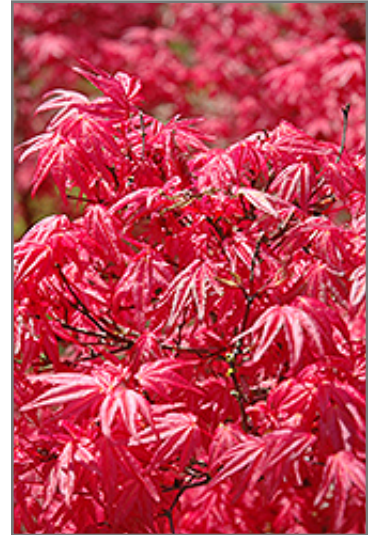
Shindeshojo Japanese Maple in spring