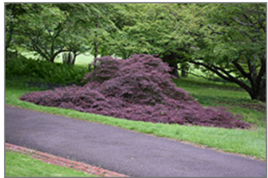
Garnet Cutleaf Japanese Maple