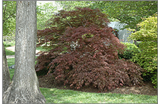
Garnet Cutleaf Japanese Maple

Garnet Cutleaf Japanese Maple will grow to be about 10 feet tall at maturity, with a spread of 8 feet. It has a low canopy with a typical clearance of 1 foot from the ground, and is suitable for planting under power lines. It grows at a fast rate, and under ideal conditions can be expected to live for 60 years or more.