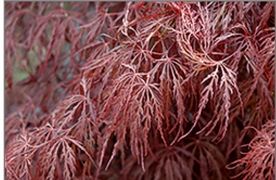
Crimson Queen Japanese Maple foliage

Crimson Queen Japanese Maple is recommended for the following landscape applications;