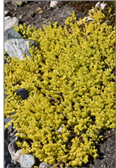
Goldilocks Creeping Jenny

Goldilocks Creeping Jenny will grow to be only 6 inches tall at maturity, with a spread of 3 feet. When grown in masses or used as a bedding plant, individual plants should be spaced approximately 24 inches apart. Its foliage tends to remain low and dense right to the ground. It grows at a fast rate, and under ideal conditions can be expected to live for approximately 10 years. As an herbaceous perennial, this plant will usually die back to the crown each winter, and will regrow from the base each spring. Be careful not to disturb the crown in late winter when it may not be readily seen!