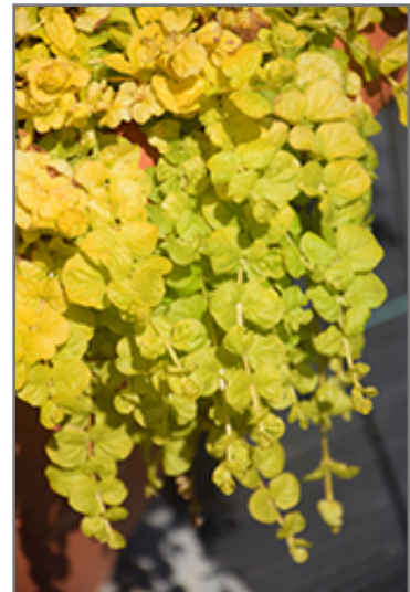
Goldilocks Creeping Jenny foliage