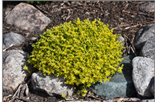
Golden Moss Stonecrop in bloom