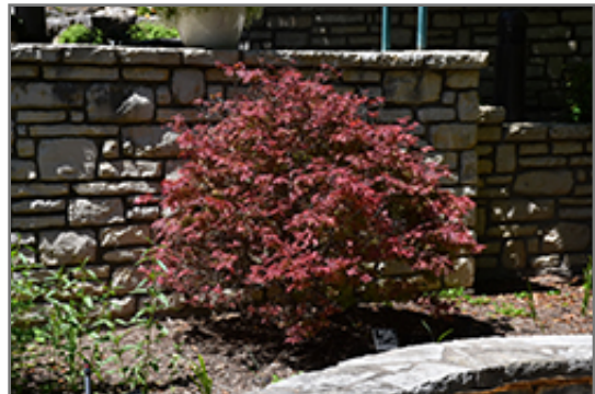
Shaina Japanese Maple

Shaina Japanese Maple is recommended for the following landscape applications;