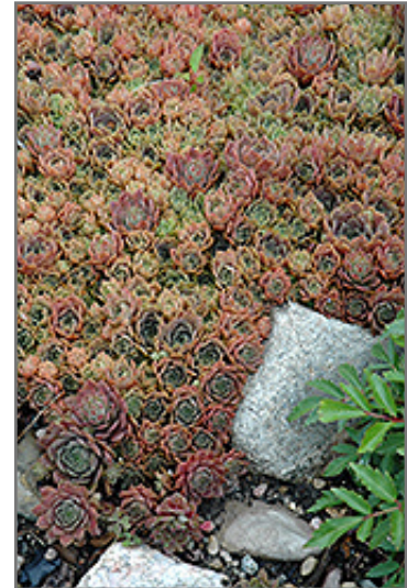
Silverine Hens And Chicks