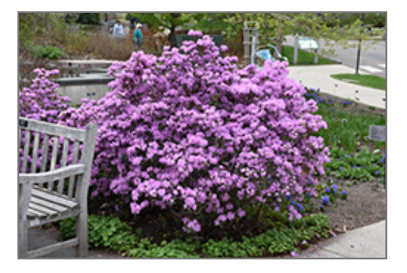
P.J.M. Rhododendron in bloom

P.J.M. Rhododendron is recommended for the following landscape applications;