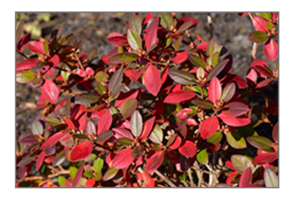
P.J.M. Rhododendron in fall

This shrub does best in full sun to partial shade. You may want to keep it away from hot, dry locations that receive direct afternoon sun or which get reflected sunlight, such as against the south side of a white wall. It requires an evenly moist well-drained soil for optimal growth, but will die in standing water. It is very fussy about its soil conditions and must have rich, acidic soils to ensure success, and is subject to chlorosis (yellowing) of the foliage in alkaline soils. It is somewhat tolerant of urban pollution, and will benefit from being planted in a relatively sheltered location. Consider applying a thick mulch around the root zone in winter to protect it in exposed locations or colder microclimates. This particular variety is an interspecific hybrid.