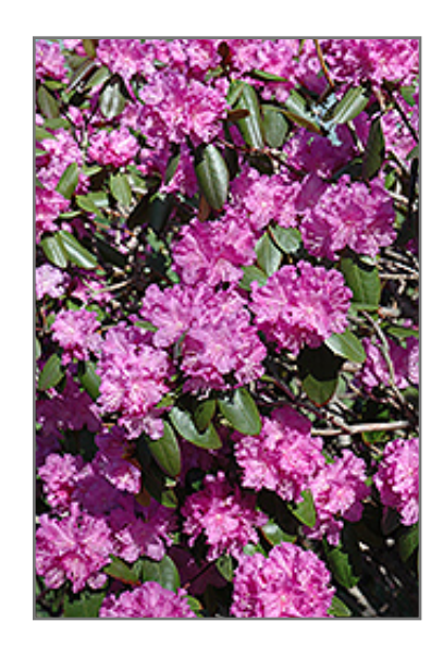
P.J.M. Rhododendron flowers