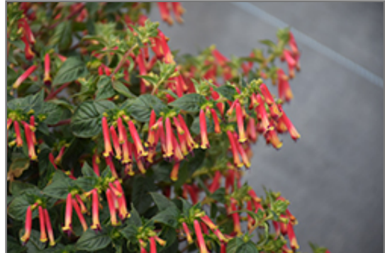
Hummingbird's Lunch Cuphea flowers

Hummingbird's Lunch Cuphea is recommended for the following landscape applications;