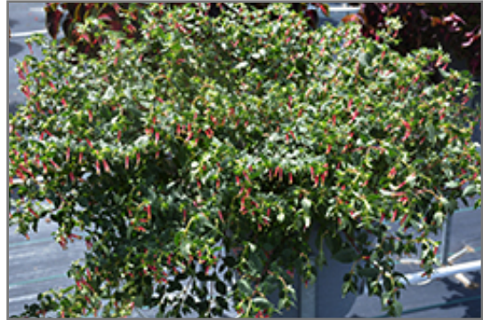
Hummingbird's Lunch Cuphea in bloom

Hummingbird's Lunch Cuphea will grow to be about 24 inches tall at maturity, with a spread of 3 feet. When grown in masses or used as a bedding plant, individual plants should be spaced approximately 30 inches apart. It tends to fill out right to the ground and therefore doesn't necessarily require facer plants in front. It grows at a fast rate, and under ideal conditions can be expected to live for approximately 10 years.