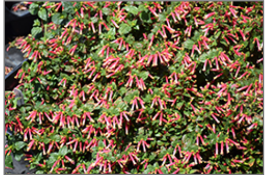
Hummingbird's Lunch Cuphea in bloom

Hummingbird's Lunch Cuphea will grow to be about 24 inches tall at maturity, with a spread of 3 feet. When grown in masses or used as a bedding plant, individual plants should be spaced approximately 30 inches apart. It tends to fill out right to the ground and therefore doesn't necessarily require facer plants in front. It grows at a fast rate, and under ideal conditions can be expected to live for approximately 10 years.