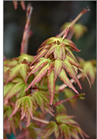
Bihou Japanese Maple foliage