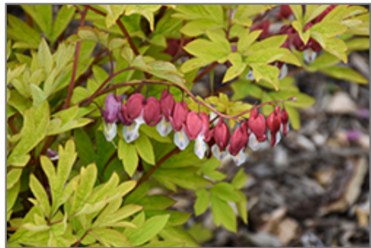
Ruby Gold Bleeding Heart flowers