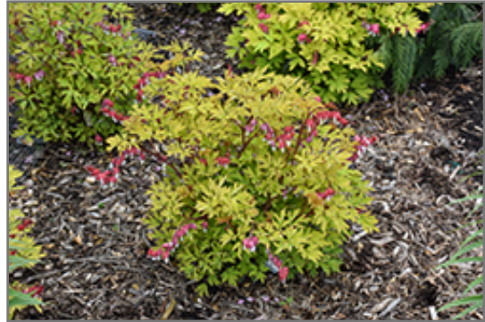
Ruby Gold Bleeding Heart in bloom

Ruby Gold Bleeding Heart will grow to be about 3 feet tall at maturity, with a spread of 3 feet. When grown in masses or used as a bedding plant, individual plants should be spaced approximately 30 inches apart. It grows at a medium rate, and under ideal conditions can be expected to live for approximately 15 years. As an herbaceous perennial, this plant will usually die back to the crown each winter, and will regrow from the base each spring. Be careful not to disturb the crown in late winter when it may not be readily seen! As this plant tends to go dormant in summer, it is best interplanted with late-season bloomers to hide the dying foliage.