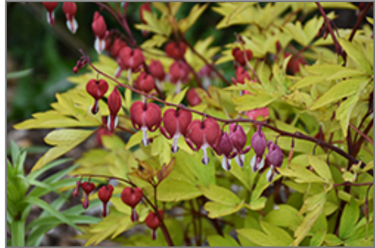
Ruby Gold Bleeding Heart flowers

Ruby Gold Bleeding Heart is recommended for the following landscape applications;