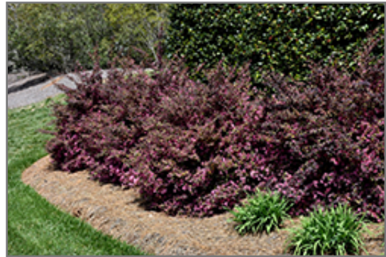
Red-Flowered Chinese Fringeflower in bloom