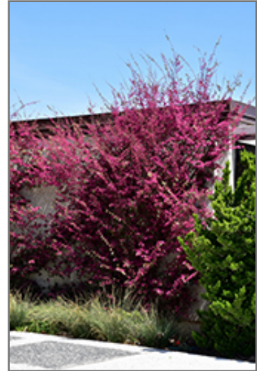
Red-Flowered Chinese Fringeflower in bloom

This shrub does best in full sun to partial shade. It prefers to grow in average to moist conditions, and shouldn't be allowed to dry out. It is particular about its soil conditions, with a strong preference for rich, acidic soils. It is somewhat tolerant of urban pollution. Consider applying a thick mulch around the root zone in winter to protect it in exposed locations or colder microclimates. This is a selected variety of a species not originally from North America.