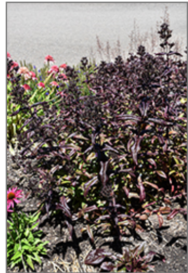
Dakota Burgundy Beard Tongue

Dakota Burgundy Beard Tongue is a fine choice for the garden, but it is also a good selection for planting in outdoor pots and containers. With its upright habit of growth, it is best suited for use as a 'thriller' in the 'spiller-thriller-filler' container combination; plant it near the center of the pot, surrounded by smaller plants and those that spill over the edges. Note that when growing plants in outdoor containers and baskets, they may require more frequent waterings than they would in the yard or garden.