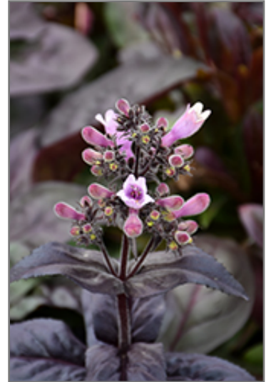
Dakota Burgundy Beard Tongue flowers

Dakota Burgundy Beard Tongue is an herbaceous perennial with an upright spreading habit of growth. Its medium texture blends into the garden, but can always be balanced by a couple of finer or coarser plants for an effective composition.