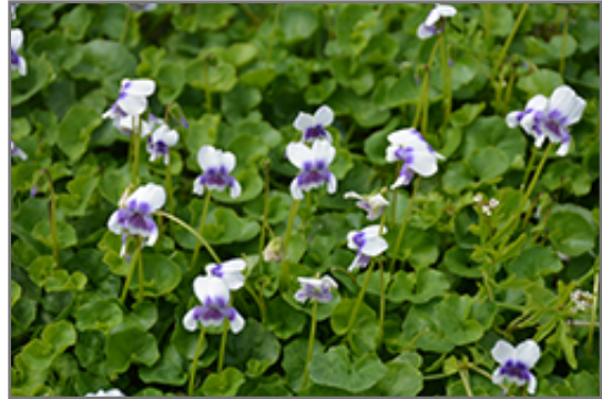
Australian Violet flowers

Australian Violet is recommended for the following landscape applications;