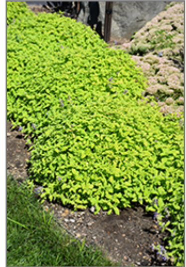
Chartreuse On The Loose Catmint