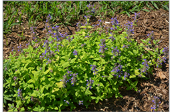
Chartreuse On The Loose Catmint in bloom