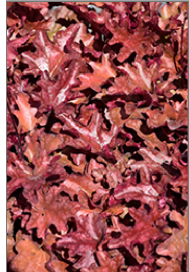
Peach Flambe Coral Bells foliage

This is a relatively low maintenance plant, and should be cut back in late fall in preparation for winter. It is a good choice for attracting hummingbirds to your yard. It has no significant negative characteristics.