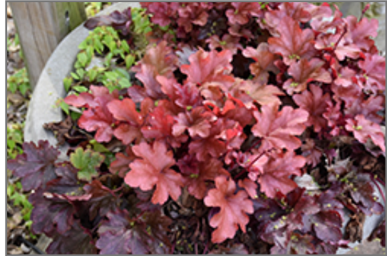
Peach Flambe Coral Bells

Peach Flambe Coral Bells is a fine choice for the garden, but it is also a good selection for planting in outdoor pots and containers. It is often used as a 'filler' in the 'spiller-thriller-filler' container combination, providing a mass of flowers and foliage against which the larger thriller plants stand out. Note that when growing plants in outdoor containers and baskets, they may require more frequent waterings than they would in the yard or garden.