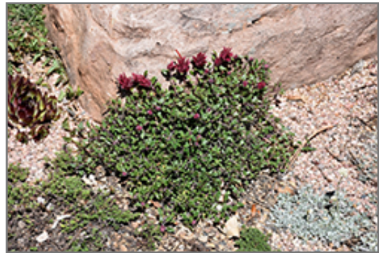
Marian Sampson Scarlet Monardella in bloom

Marian Sampson Scarlet Monardella will grow to be only 3 inches tall at maturity extending to 5 inches tall with the flowers, with a spread of 12 inches. When grown in masses or used as a bedding plant, individual plants should be spaced approximately 8 inches apart. Its foliage tends to remain low and dense right to the ground. It grows at a medium rate, and under ideal conditions can be expected to live for approximately 3 years. As an evergreen perennial, this plant will typically keep its form and foliage year-round.