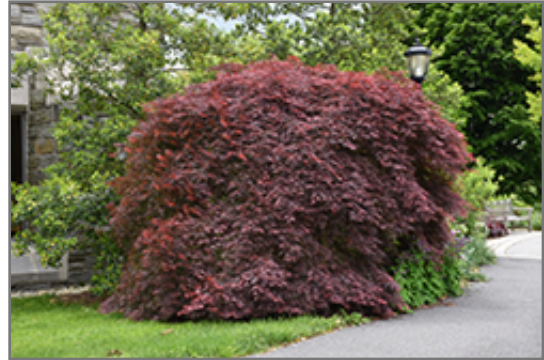
Tamukeyama Japanese Maple

Tamukeyama Japanese Maple will grow to be about 7 feet tall at maturity, with a spread of 10 feet. It tends to be a little leggy, with a typical clearance of 3 feet from the ground, and is suitable for planting under power lines. It grows at a slow rate, and under ideal conditions can be expected to live for 80 years or more.