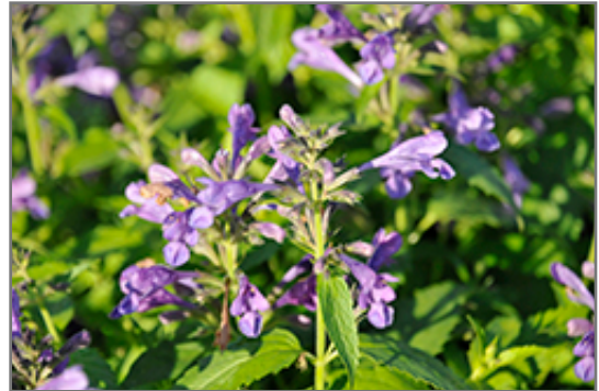
Prelude Purple Catmint flowers