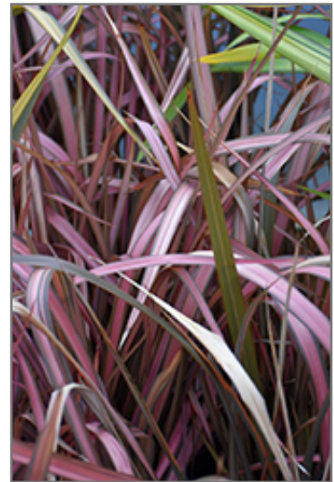
Pink Panther New Zealand Flax foliage