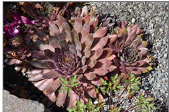
Kalinda Hens And Chicks

Kalinda Hens And Chicks is recommended for the following landscape applications;