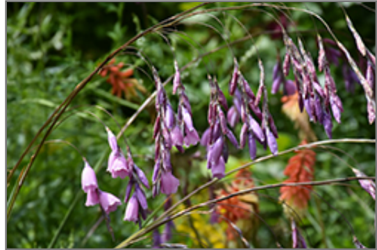
Angel's Fishing Rod flowers

Angel's Fishing Rod is recommended for the following landscape applications;