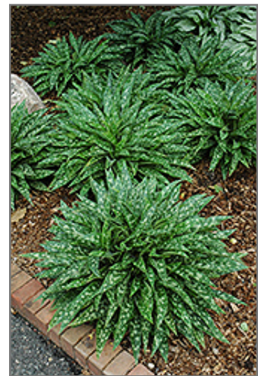
Raspberry Splash Lungwort