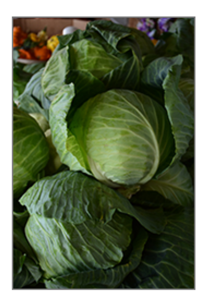
Copenhagen Market Cabbage fruit

This plant is typically grown in a designated vegetable garden. It should only be grown in full sunlight. It does best in average to evenly moist conditions, but will not tolerate standing water. It is not particular as to soil pH, but grows best in rich soils. It is somewhat tolerant of urban pollution. Consider applying a thick mulch around the root zone over the growing season to conserve soil moisture. This is a selected variety of a species not originally from North America, and it is considered by many to be an heirloom variety.