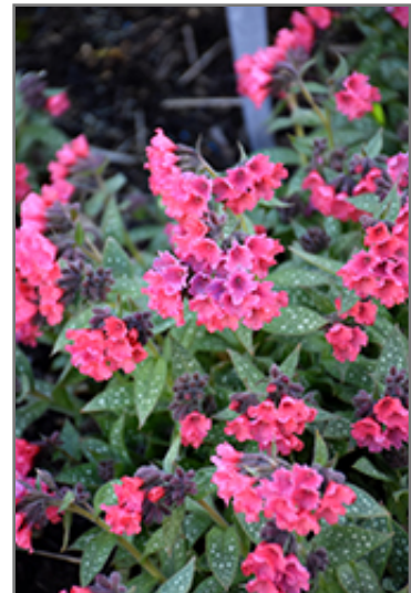
Shrimps On The Barbie Lungwort flowers

Shrimps On The Barbie Lungwort is recommended for the following landscape applications;