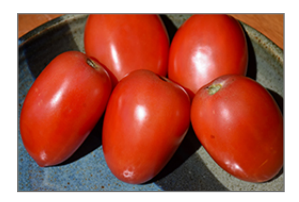
Amish Paste Tomato fruit

Amish Paste Tomato will grow to be about 6 feet tall at maturity, with a spread of 24 inches. When planted in rows, individual plants should be spaced approximately 3 feet apart. Because of its vigorous growth habit, it may require staking or supplemental support. This fast-growing vegetable plant is an annual, which means that it will grow for one season in your garden and then die after producing a crop.