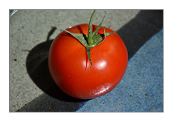
Early Girl Tomato fruit

Early Girl Tomato will grow to be about 6 feet tall at maturity, with a spread of 3 feet. When planted in rows, individual plants should be spaced approximately 3 feet apart. Because of its vigorous growth habit, it may require staking or supplemental support. This fast-growing vegetable plant is an annual, which means that it will grow for one season in your garden and then die after producing a crop.