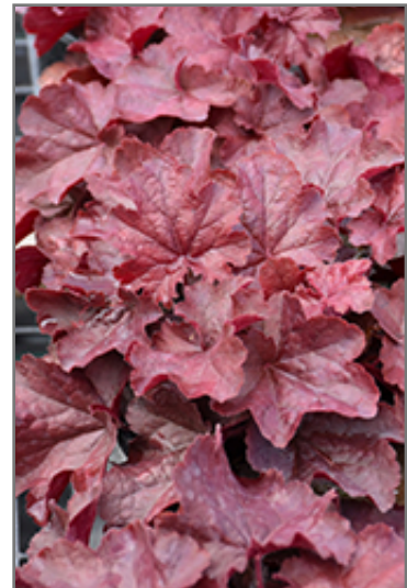
Northern Exposure Red Coral Bells foliage

Northern Exposure Red Coral Bells is recommended for the following landscape applications;