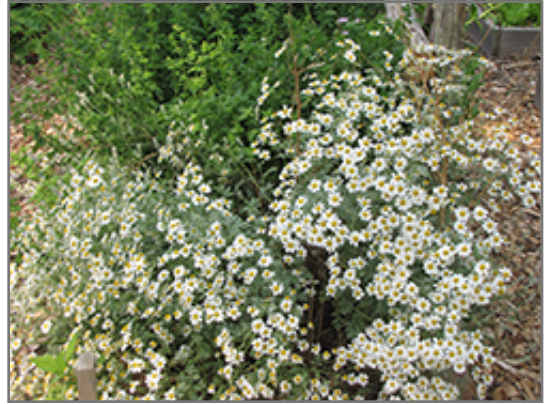
German Chamomile

This plant is quite ornamental as well as edible, and is as much at home in a landscape or flower garden as it is in a designated herb garden. It does best in full sun to partial shade. It is very adaptable to both dry and moist locations, and should do just fine under typical garden conditions. It is not particular as to soil type or pH. It is somewhat tolerant of urban pollution. This species is not originally from North America.