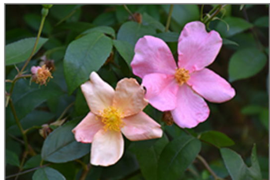
China Rose flowers